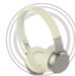
Lenovo Yoga Active Noise-cancellation Headphones