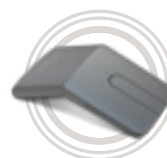
Lenovo Yoga Mouse with Laser Presenter