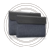
Lenovo Yoga Sleeves (14" and 15")

* Example of Lenovo catalogue naming convention