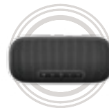
Lenovo 700 Ultraportable Bluetooth® Speaker

* Example of Lenovo catalogue naming convention