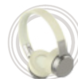
Lenovo Yoga Active Noise-cancellation Headphones